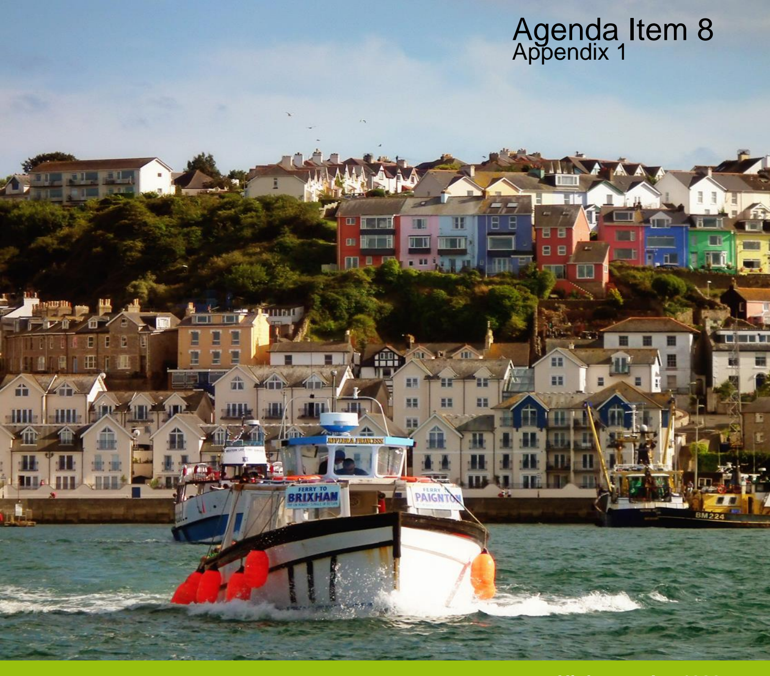
Highways Act 1980